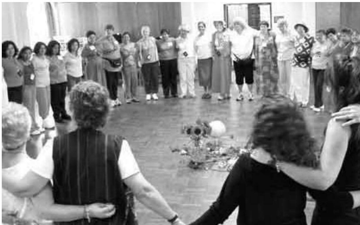
Closing ritual of the first U.S. Capacitar Conference with participants from 10 states, Mexico and border communities—San Diego, CA